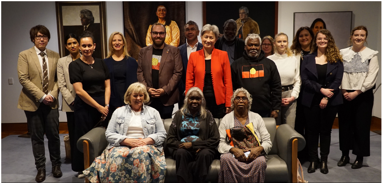
Previous workshop participants meeting Minister Penny Wong at Parliament House in November 2022.